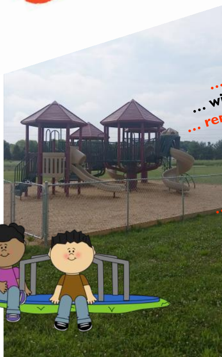
Wyoming Church Youth at Dorney Park, PA