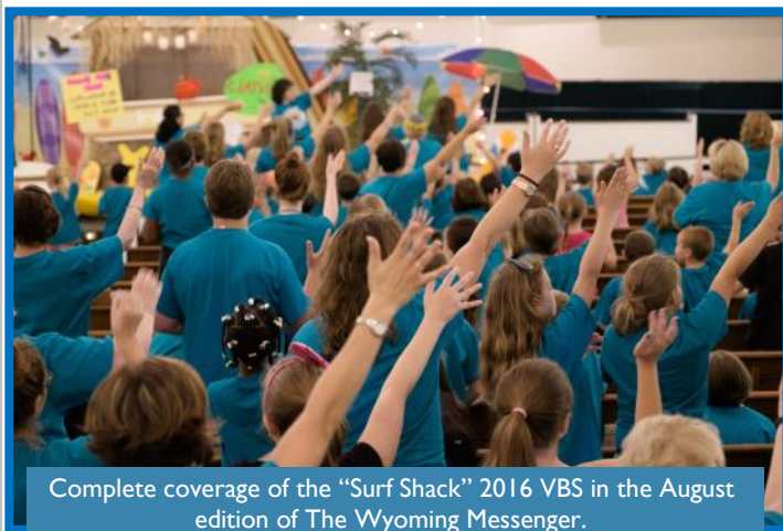
Complete coverage of the "Surf Shack" 2016 VBS in the August edition of The Wyoming Messenger.